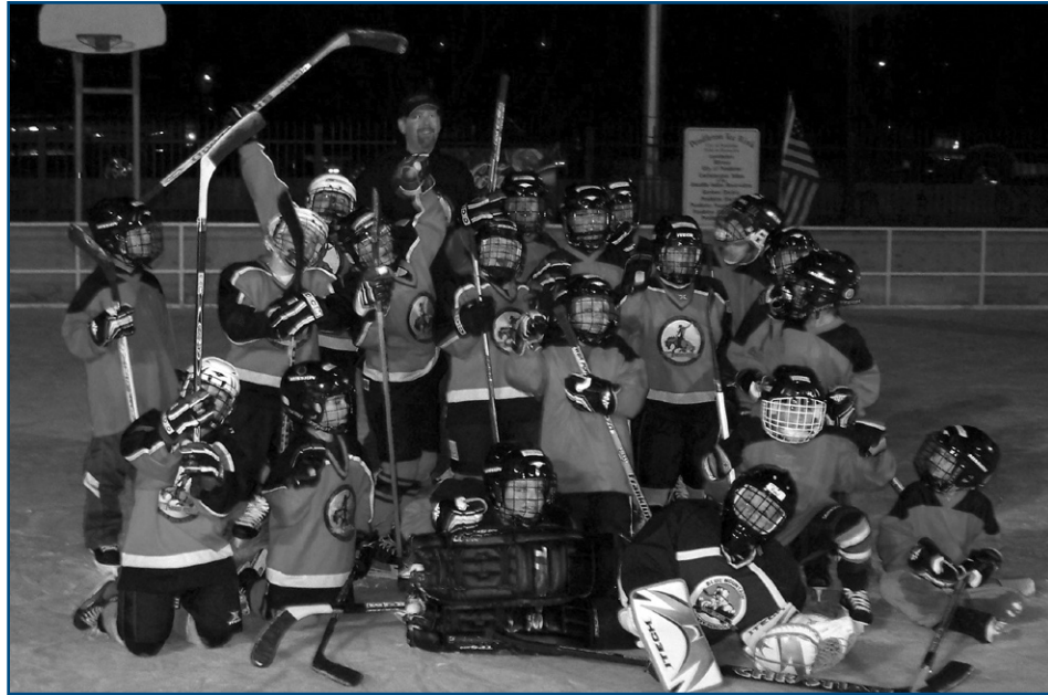
Pendleton Rough Riders hockey team at their very first game in Dec. 2007

In the summer of 2009, they finally got their federal non-profit status. Due to the