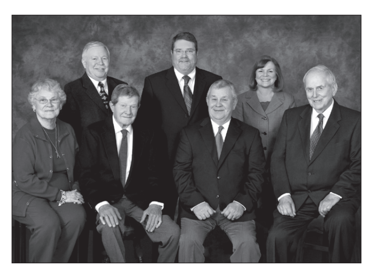
Pendleton Foundation Trust Board of Directors

222 S.E. Dorion P.O. Box 218 Pendleton, OR. 97801