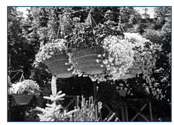
The City of Pendleton was in charge of the care of the flowers during the summer.

he Pendleton Foundation Trust has long been interested in the beautification efforts in the local community. The Main Street project to place flower pots on the light posts was an opportunity for the Foundation to cooperate in this endeavor. A grant of $3,700 was given for the brackets to hold the baskets. The Foundation office accepted donations for the designated project, which were forwarded to the city. The response was overwhelming - $4,000 was collected. The beautification project brought positive comments concerning the welcoming and friendly look of Main Street.