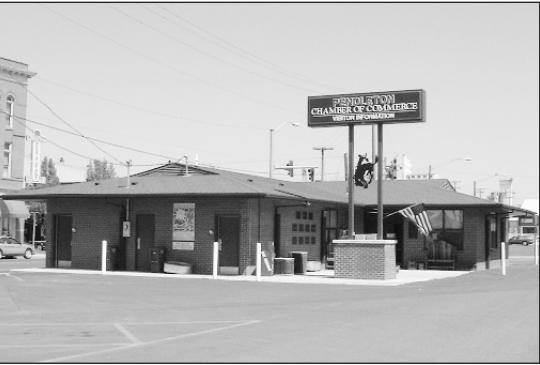
Pendleton Chamber of Commerce.