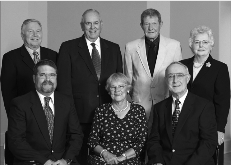
Pendleton Foundation Trust Board of Directors

These contributions are held in trust accounts and administered by a seven member Trust Board. Only the income earned from these gifts is used to make grants to applicant organizations. All donations, large or small, help the principal grow and make it possible to give more to the community. A gift to the Pendleton Foundation Trust is a tax-exempt contribution and may be mailed to the Pendleton Foundation Trust, P.O. Box 218, Pendleton, Oregon 97801.