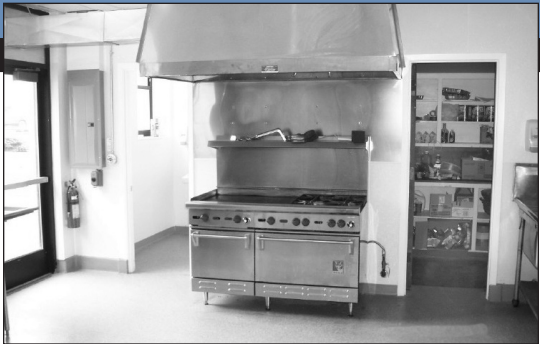
Kitchen of Pendleton Foundation Room in McCune Recreation Center.