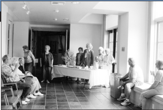
Pendleton Foundation Gallery U.C.H.S. Heritage Station.

The Pendleton Recreation Center was awarded $4,135 to purchase four sets of moveable aluminum bleachers for a wide variety of activities at the Youth Center. Oregon State University Umatilla County Master Gardeners Association of Pendleton was awarded $4,000 to purchase materials to build a fence, compost bins and storage unit at the Education Service District land in Pendleton, referred to as the Tower Garden. All produce grown will be distributed to local charitable organizations. The Foundation awarded $1,829 to purchase a small, riding lawn mower for Harris Junior Academy. The Pendleton Blaze ASA Fast Pitch Softball Team was awarded $1,500 to purchase helmets, masks, shin guards and other equipment and supplies. Educational material for expectant and new mothers will be purchased by Pendleton Pregnancy Care Services with $ 1,251 from the Foundation. The active Senior Center of Pendleton received $750 to purchase an upright freezer for the Center. Lincoln Primary School received $180 to purchase a wireless microphone system for concerts and assemblies. □□□