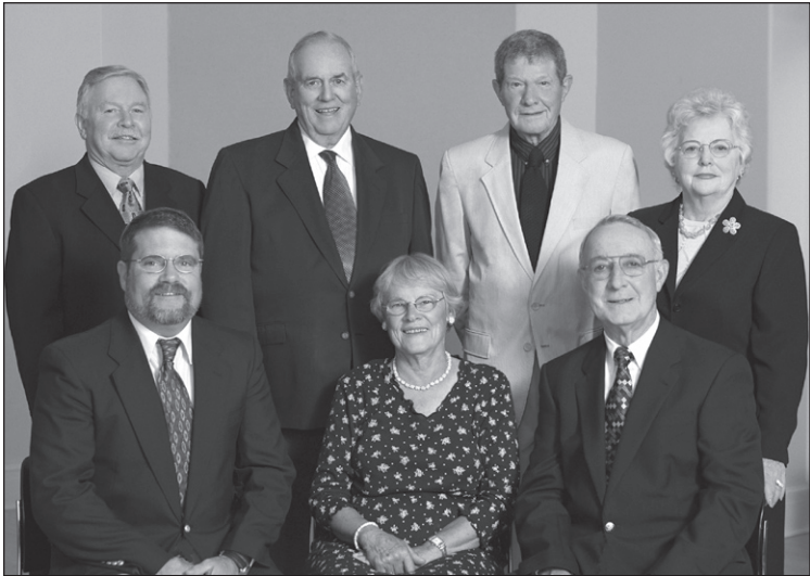
Pendleton Foundation Trust Board of Directors