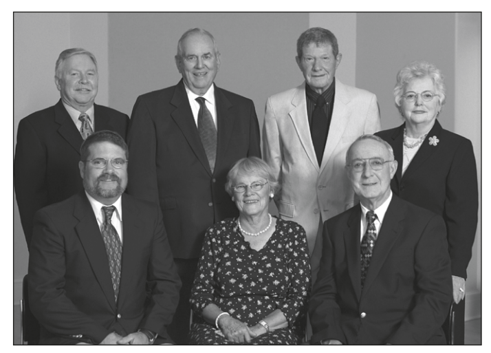
Pendleton Foundation Trust Board of Directors

PRE-SORT STD US POSTAGE PAID PERMIT # 57 PENDLETON, OR