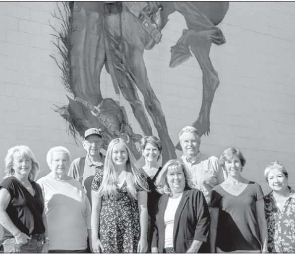
Some of the alumni of the Pendleton High School Class of '79 and other classes