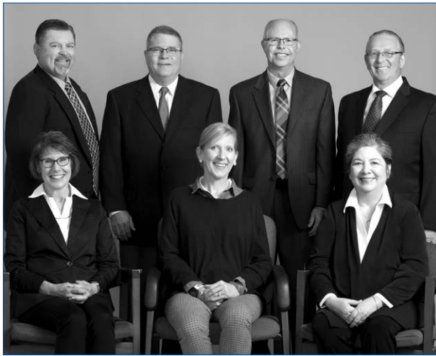
Pendleton Foundation Trust Board of Directors